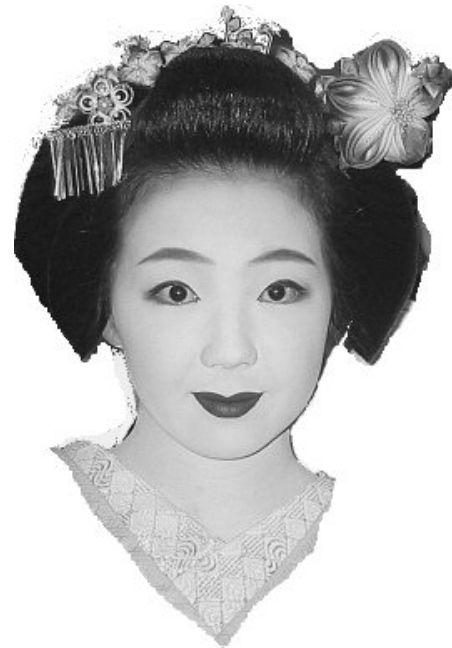
Carina Alves has kindly contributed the following personal report from the conference in Kyoto.